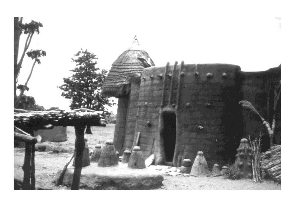
Among the Tamberma, the thresholds of dwellings are always surrounded by an array of small fetish mounds.